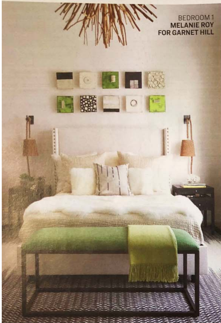
BEDROOM 1 MELANIE ROY FOR GARNET HILL