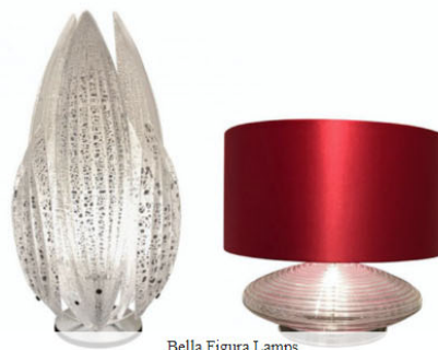
Bella Figura Lamps

Dimmers are essential for overhead lighting, and will of course change the atmosphere in a space when lowered or lifted; but using ambient lighting cleverly is the trick to creating mood in a room. Ambient lighting is light that comes from all directions in a uniform, unfocused, indirect manner. The Bella Figura Beehive, with light reflecting onto the glass lamp base and above the shade in tandem with The Bella Figura Paradise Lamp, where the light lives within the lamp body itself, would certainly be a dramatic duo.